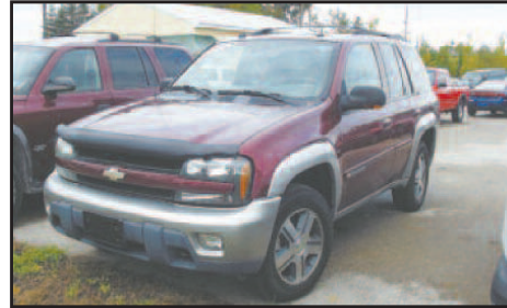
'04 Chevy Trailblazer LTZ 4x4, loaded, pwr moon roof From $199 Mo.*