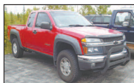
'04 Chevy Colorado 4x4 Extended Cab From $199 Mo.*