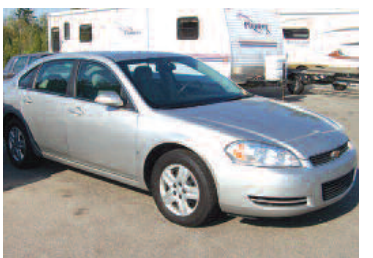
2008 Chevy Impala. Very nice. From $249/mo*