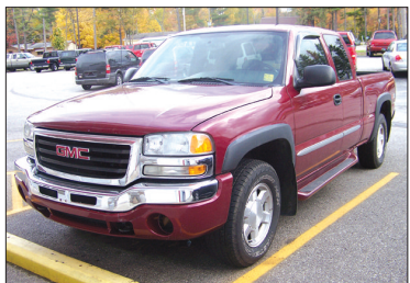
2004 GMC Extended Cab Z-71 Package, 4WD, Power From $249/mo*