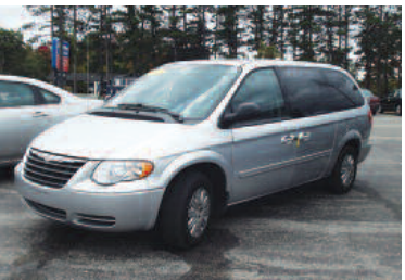
2007 Chrysler T&C 7 pass. seating, stow & go From $199/mo*