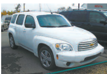
2009 Chevy HHR From $249/mo*