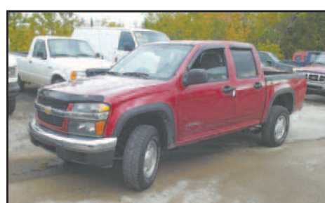
'05 Chevy Colorado 4x4 Crew cab From $199 Mo.*