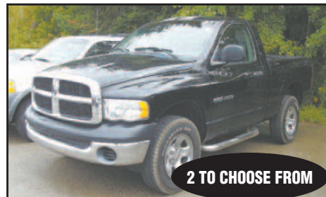
'03 Dodge Ram 4x4 Regular cab From $199 Mo.*