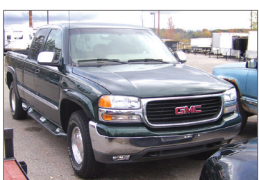
2001 GMC Extended Cab Z-71 Package, 4WD, Power From $249/mo*