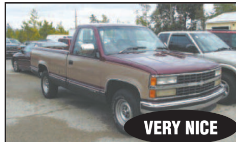
'03 Chevy 1/2 Ton Regular cab, 104k miles $2,995*