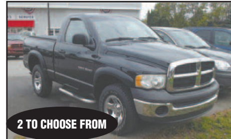
'02 Dodge Ram 4x4 Regular cab From $199 Mo.*