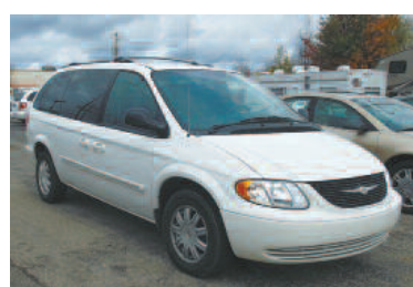
2007 Dodge Caravan 3rd row seating From $199/mo*