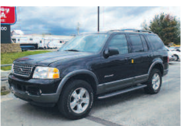
2004 Ford Explorer 4x4, leather, loaded From $199/mo*