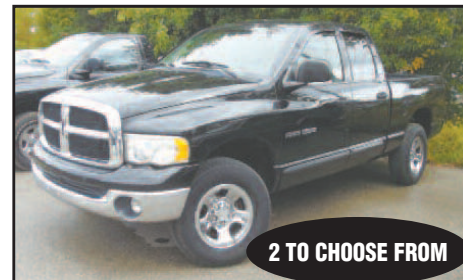
'02 Dodge Ram 4x4 Crew Cab From $199 Mo.*