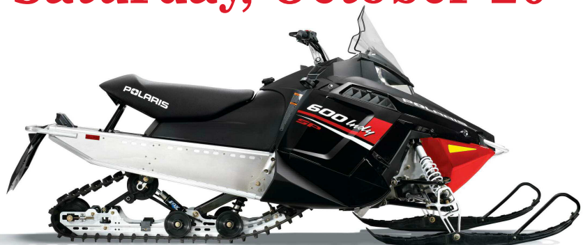
THE ALL NEW 2013 POLARIS 600 INDY

Friday, October 12 thru Saturday, October 20