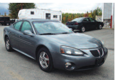
'04 Pontiac Grand Prix GT sun roof From $199/mo*