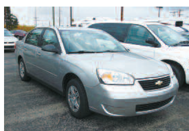
2007 Chevy Malibu loaded From $199/mo*