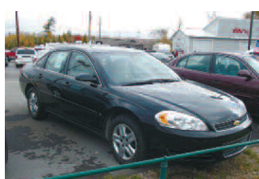
2007 Chevy Impala Loaded From $199/mo*

*Plus tax, title, license fees. Approved credit. See dealer for details