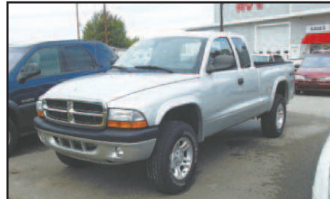
'03 Dodge Dakota Extended cab From $199 Mo.*