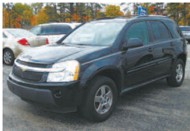
2005 Chevy Equinox From $199/mo*