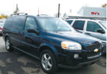
2005 Chevy Uplander. Loaded, Leather, DVD. From $199/mo*