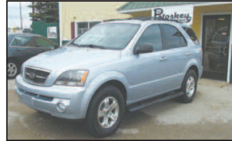
'05 Kia Sorento From $199 Mo.*