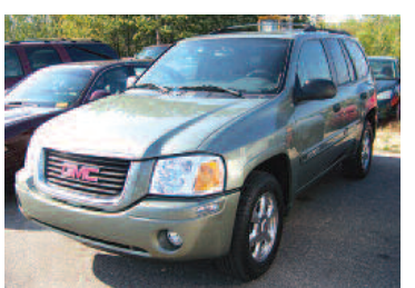
2004 GMC Envoy. From $249/mo*