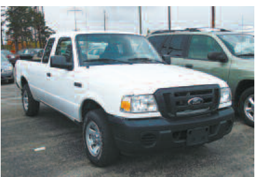
2008 Ford Ranger super cab From $199/mo*