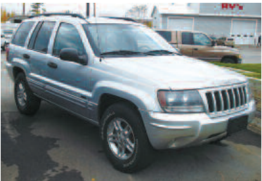
2004 Jeep Cherokee. 4WD. From $249/mo*