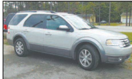
'08 Ford Taurus Wagon From $199 Mo.*