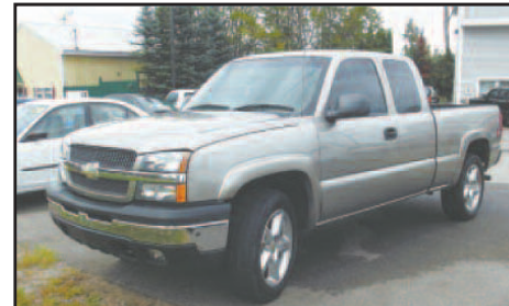
'03 Chevy Extended cab From $249 Mo.*