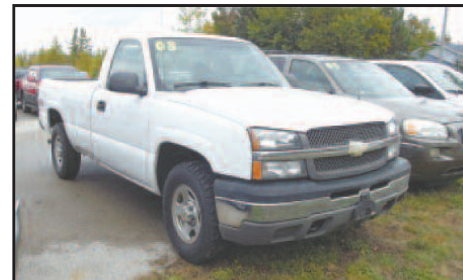
'03 Chevy Regular cab From $199 Mo.*